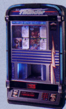
Digital Thunder Wall™

For full information on our HyperBeam sound system, ask for a copy of our booklet: "Technology that works. And keeps on working."