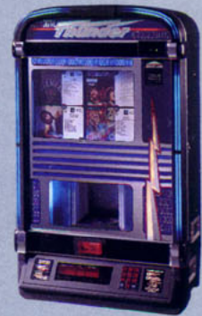
Digital Thunder Wall™

For full information on our HyperBeam sound system, ask for a copy of our booklet: "Technology that works. And keeps on working."