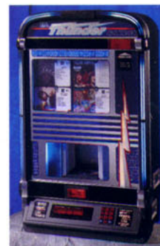
Digital Thunder Wall™

40" H x 26" W x 14" D (101cm H x 65cm W x 36cm D) 183 lbs. (83 kg)