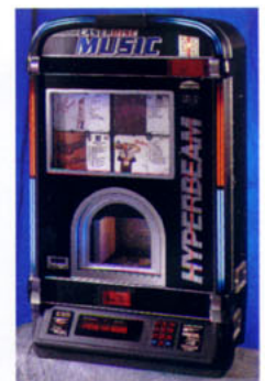
Performer Wall 2000™

For full information on our HyperBeam sound system, ask for a copy of our booklet: "Technology that works. And keeps on working."