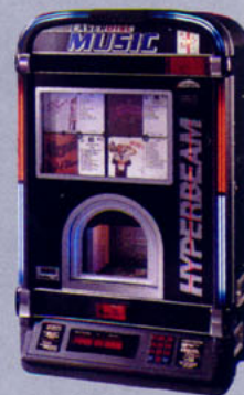
Performer Wall 2000™

For full information on our HyperBeam sound system, ask for a copy of our booklet: "Technology that works. And keeps on working."