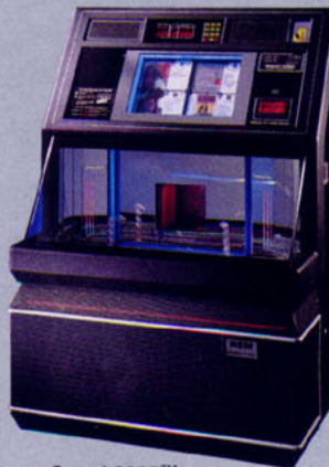
Performer Grand 2000™